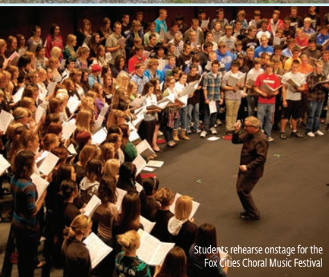
Students rehearse onstage for the Fox Cities Choral Music Festival