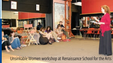
Unsinkable Women workshop at Renaissance School for the Arts