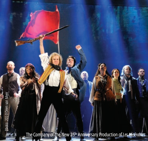
The Company of The New 25 th Anniversary Production of Les Misérables