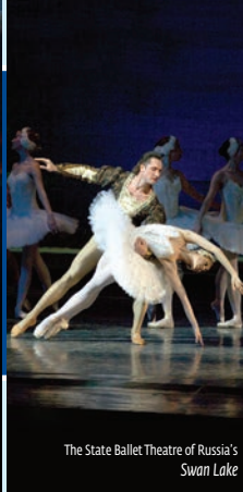
The State Ballet Theatre of Russia's Swan Lake