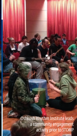
Oshkosh Rhythm Institute leads a community engagement activity prior to STOMP